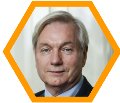
Michael T. Osterholm, Ph.D. University of Minnesota